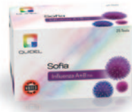
Influenza A+B FIA