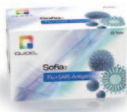
Flu + SARS