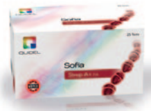
Strep A+ FIA